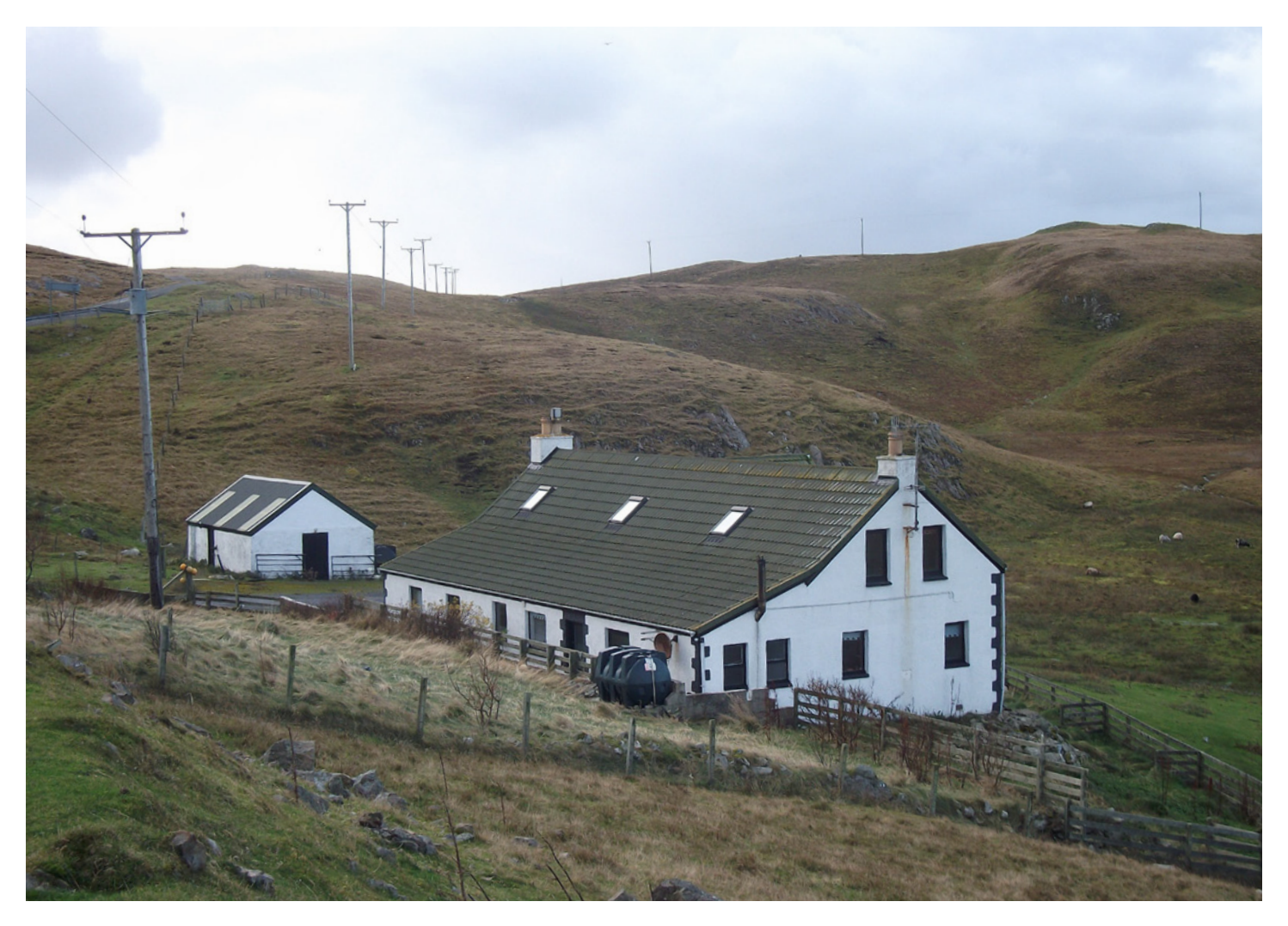
Situated in an idyllic rural setting, this detached home requires upgrading.

The property is 25 miles from Lerwick and 7 miles from the village of Walls, which has a Primary School, shop and bakeshop, swimming pool, Public Hall and Doctor's surgery.