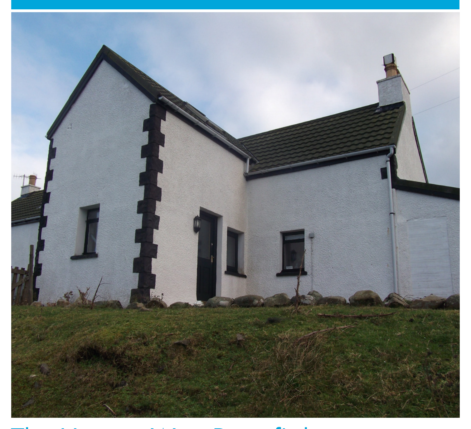
The Hogan, West Burrafirth Shetland, ZE2 9NT Offers over £110,000